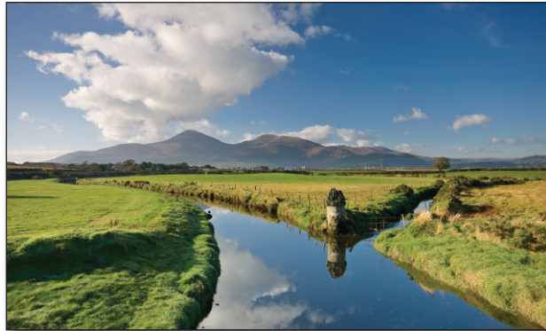
Carrigs River flows into Dundrum Inner Bay, but despite appearing to come from the direction of the Mourne Mountains, its waters come from Slieve Croob and Cratieve to the northwest.