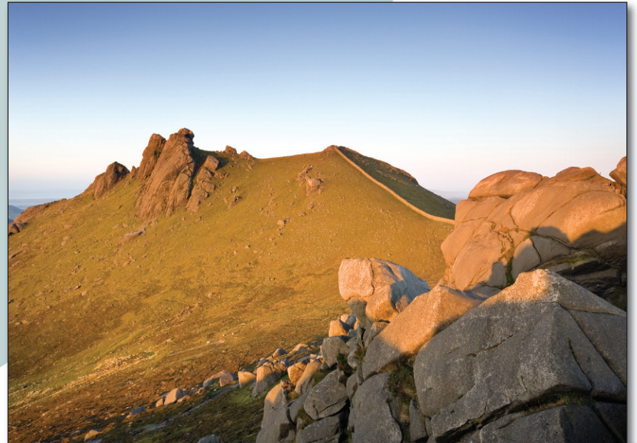
Dawn on Slieve Bearnagh viewed from the North Tor.