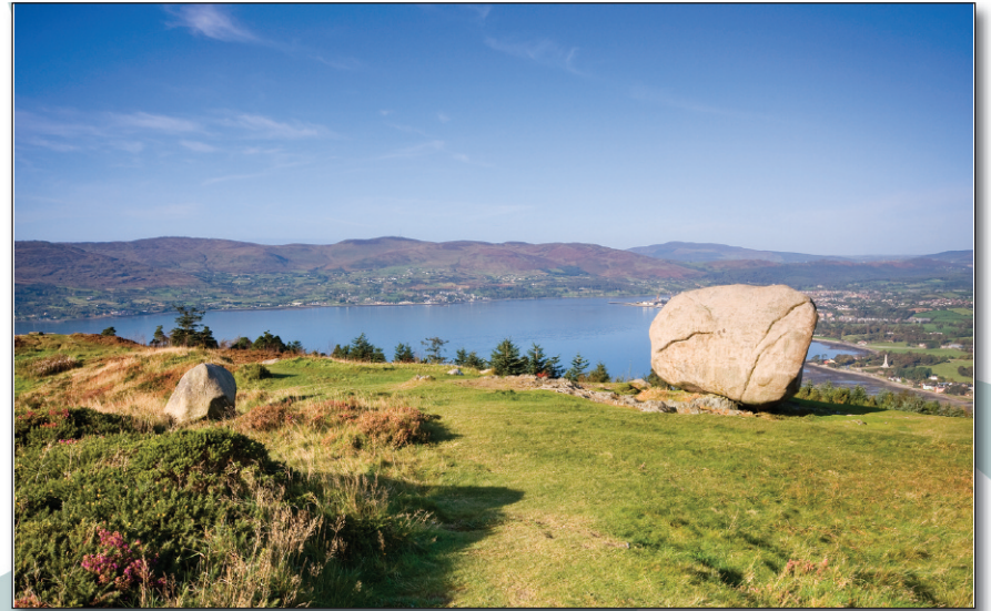
Cloughmore (An Chloch Mhór, the big stone) is a huge granite erratic that was carried along and deposited by ice during the last period of glaciation. It sits high above Rostrevor and looks out over Carlingford Lough.