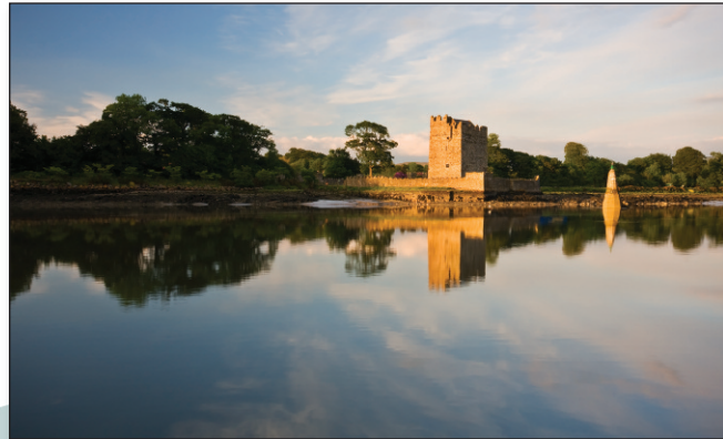
Right: There has been a keep on the site of Narrow Water Castle since 1212. It was built to prevent attacks on Newry via the river. The current keep is a fine example of a sixteenth-century Irish tower house.