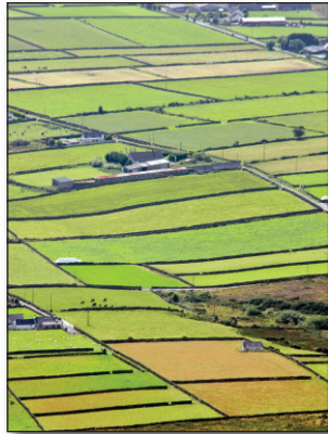
The Kilkeel plain is covered in a neat patchwork of fields.